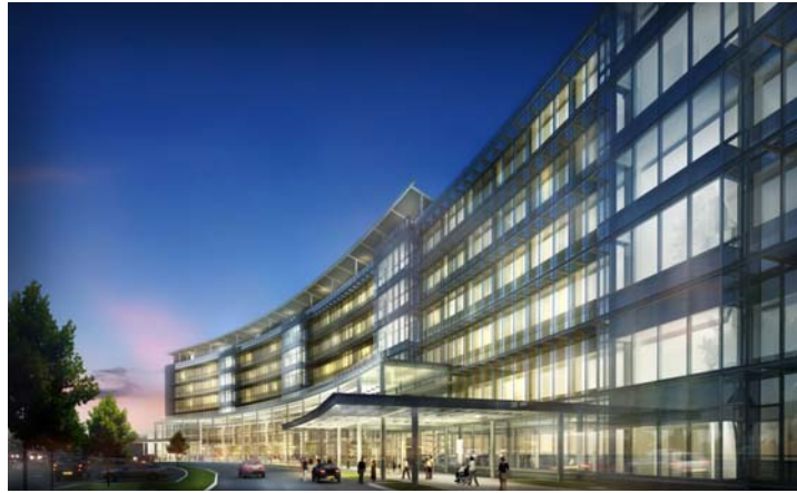
Figure 1-South Entrance of University Medical Center of Princeton

The south face of the University Medical Center of Princeton is a complete curtain wall system as you can see in Figure 1. Since this curtain wall system is facing south there is potential for significant uses of solar heating and energy making the building more sustainable. An analysis in the use of a more efficient curtain wall system that could lower energy cost and lower heating and cooling loads could lower the indirect and direct cost on the building. There is cost savings on the mechanical system with lower heating and cooling loads since the system could be smaller if a more efficient curtain wall system is put in.