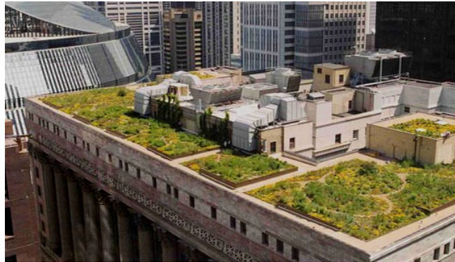
Figure 4 - Green Roof

On the University Medical Center of Princeton project there are not a lot of sustainable ideas implemented. One thing that could be looked at is a green roof that could be installed on the roof. Green roofs are very efficient in lowering mechanical loads and could be very useful in the collection of rain water runoff that could be collected to use in the grey water system. Green roofs are a growing trend in the industry that is being used more frequently now in sustainable design. The major question that remains though is why aren't more designs including green roofs in all of their projects.